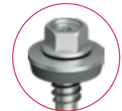
Self-drilling screw JT6-D-6H-5.5/6.3

A4 stainless steel available upon request